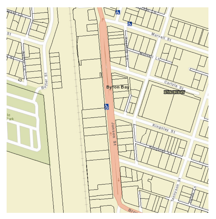
Figure 1: Accessible parking mapping focus area

There is opportunity to install a single accessible angle parking bay on the corner of Jonson St and Carlyle St, as shown in figure 2 below. The proposed location is currently two hour paid parking, revenue from this parking space brings in approximately $6,570 per year.