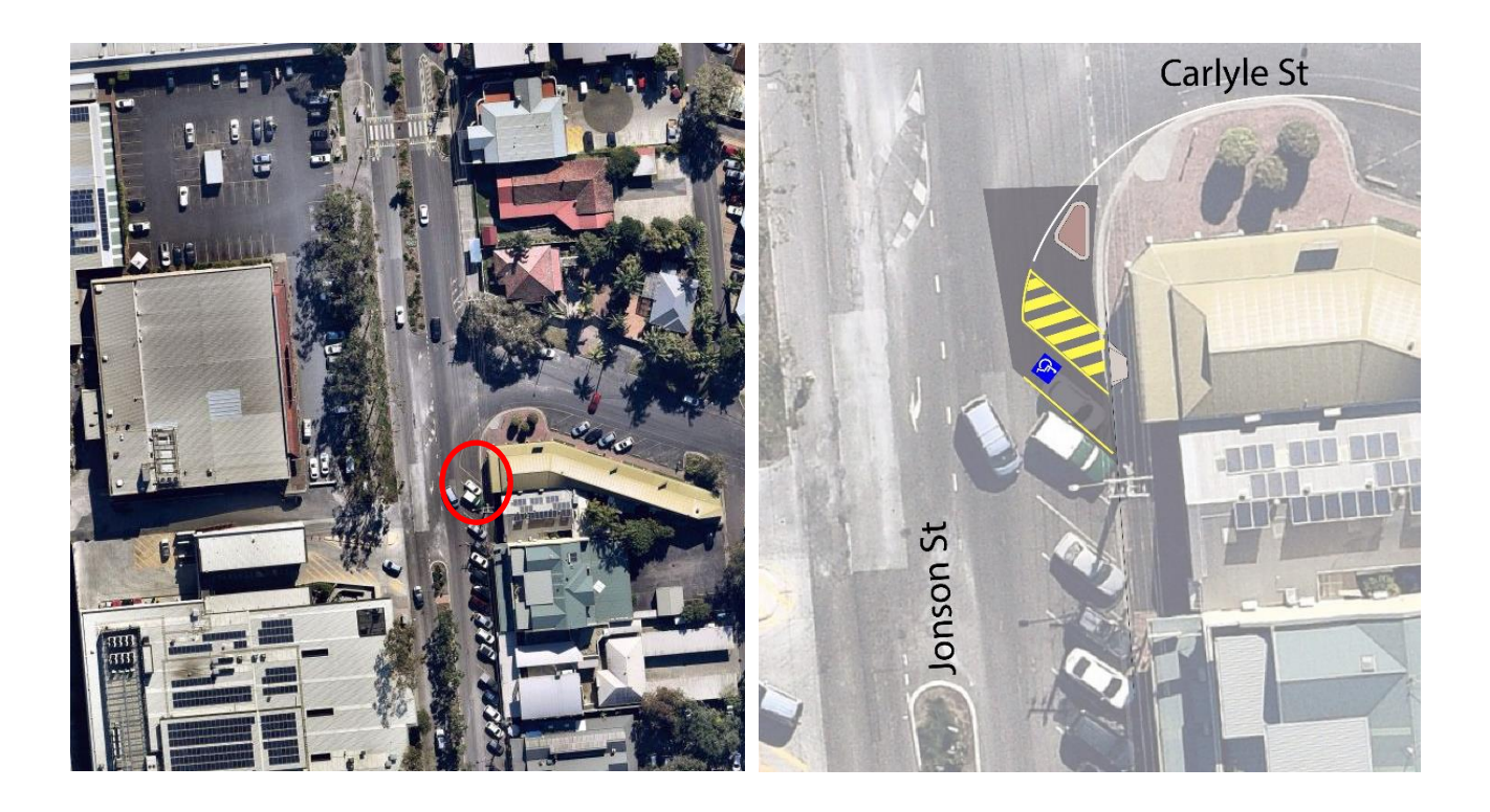
Figure 2: Proposed accessible bay location (Left), Bay design concept only (right)